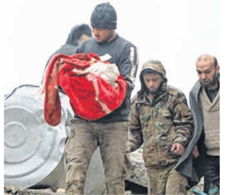
A Syrian man carries the body of an infant who was killed in an earthquake in the town of Jandar in Syria