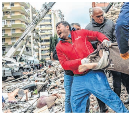
A rescuer reacts as he carries a body found in the rubble in Adana, Turkey, on Monday