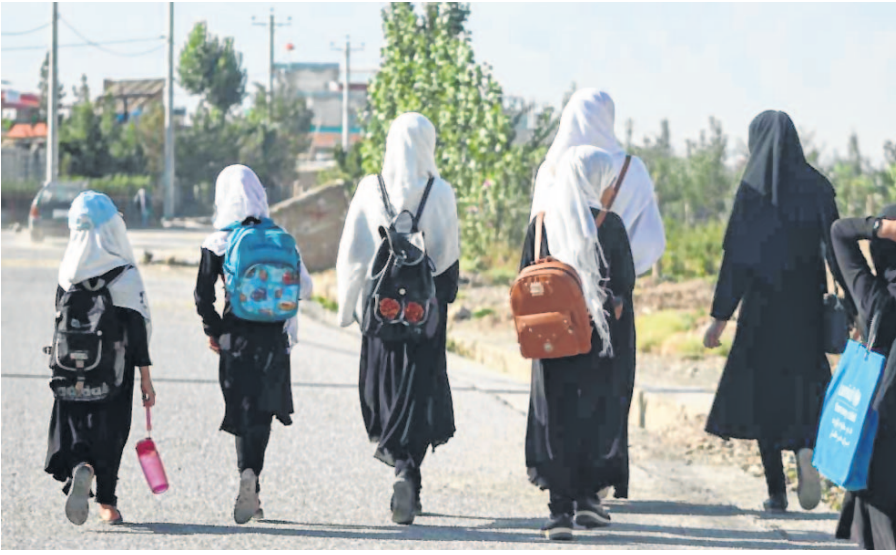
ANI / Kabul

Amid strict restrictions on women in Afghanistan under the Taliban, many creative women and girls in the country are seeking ways to bring about change and are trying to provide online education to women, Khaama Press reported.